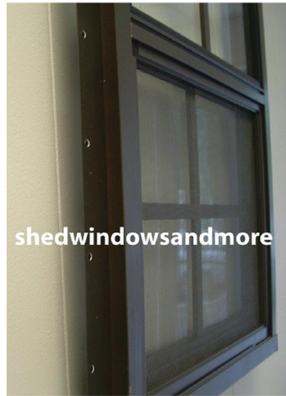
“J” Channel Window Figure 3.

If you are using a vinyl siding, the J channel window should be used since it offers a separate channel to accept the vinyl siding. Some people also like to use this channel on the T-111 to use with their trim boards around the windows. (See Figure 4.)